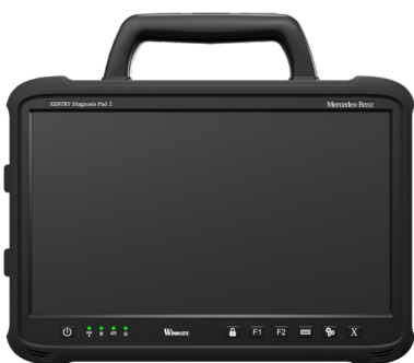
XENTRY Diagnosis Pad 2