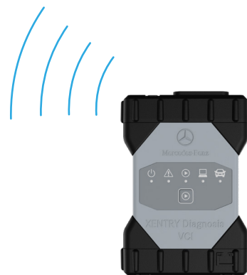
XENTRY Diagnosis VCI

The new hardware with its lighter weight and its powerful equipment ensures convenient and fast work in your workshop.